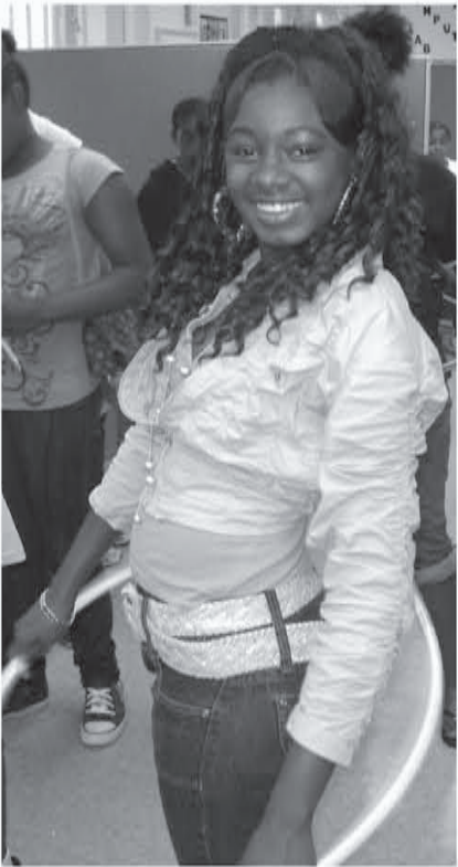
MATRIX HUMAN SERVICES