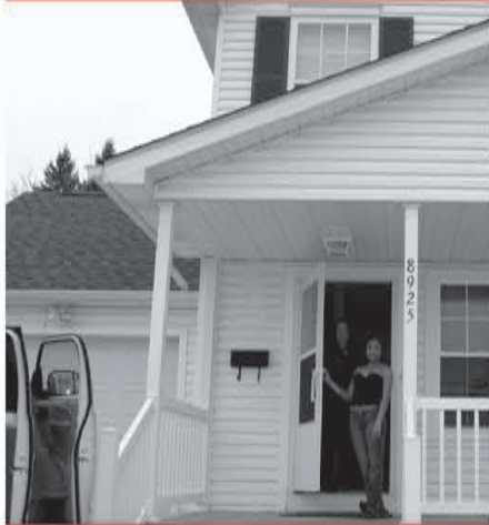
MATRIX HUMAN SERVICES