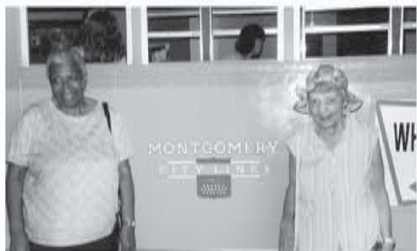
MATRIX HUMAN SERVICES